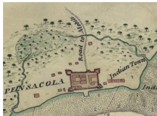
Gauld Map 1764