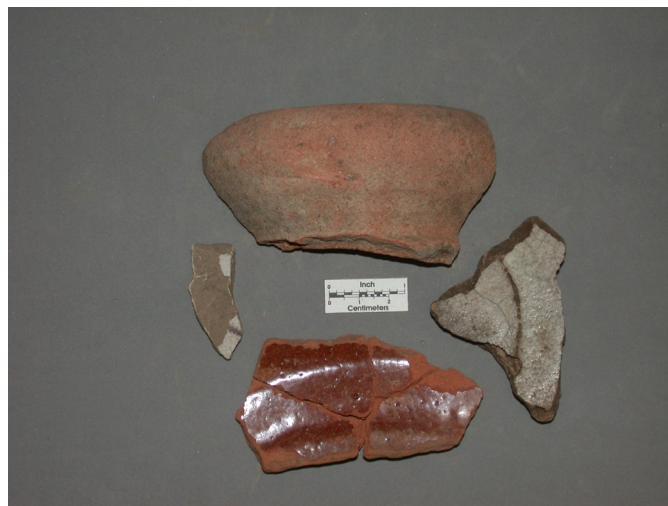
These are the first 16th Century ceramics recently recovered from the 1559 Luna settlement site.